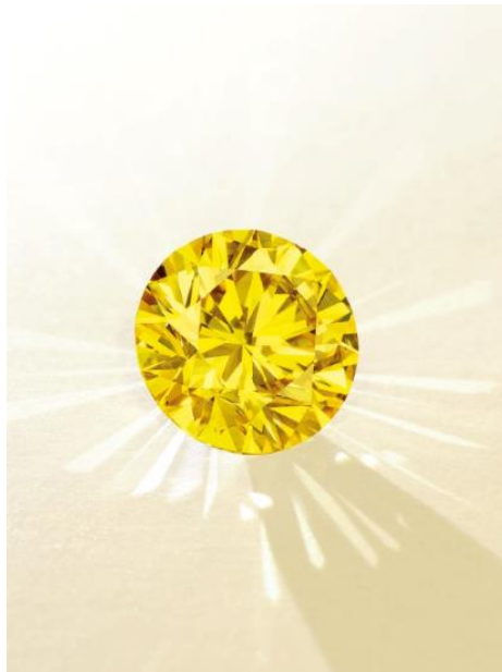
Lot 66 / 6.70-Carat Natural Fancy Deep Yellow VS1 Clarity Excellent Polish and Symmetry Diamond Ring Estimate: HK$ 3,500,000 - 5,500,000 / US$ 450,000 - 705,000

HONG KONG, 3 Nov 2020 Tiancheng International Jewellery and Jadeite Autumn Auction will take place on 28 November, offering a dazzling array of treasures. Leading the auction is a 6.70-Carat Natural Fancy Deep Yellow Diamond of intense colour and vivacity. Another star item is a 10.18-Carat D Colour Internally Flawless Type Ila Diamond that boasts superb clarity and luminescence. The sale will also showcase a stellar line-up of jadeite pieces, including a pair of Jadeite “Double Hoop” Earrings and a Jadeite “Guanyin” Pendant, which would undoubtedly be worthy additions to any prized collection.