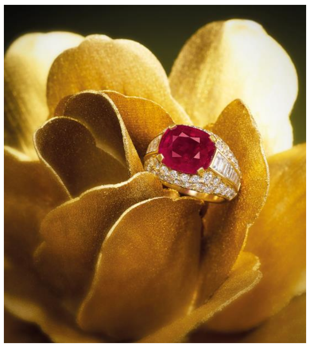
8.06-Carat Natural Unheated Burmese Mogok "Pigeon's Blood" Ruby and Diamond Ring, Bulgari Estimate: HK$ 3,500,000 – 4,500,000 / US$450,000 – 577,000

Preview: 28 Nov to 5 Dec | Auction: 6 Dec